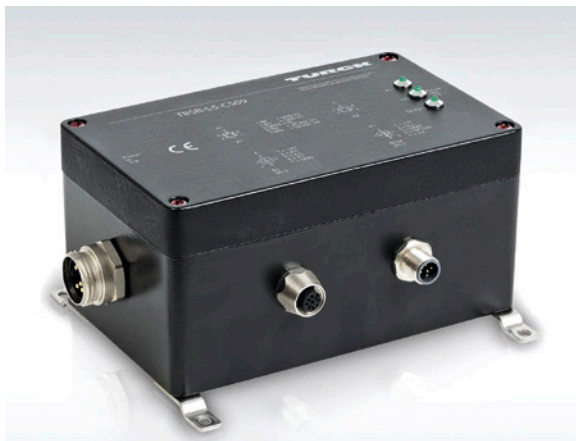
Decentralized safety solutions: The TBSB safely disconnects the actuator voltage V2 of downstream components