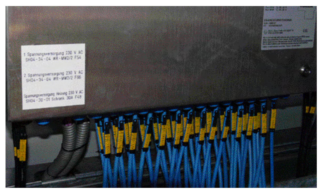
User-friendly: A 230 V power supply is sufficient for excom. The time-consuming and – due to the required large cable diameter – expensive 24V cabling is not necessary any more